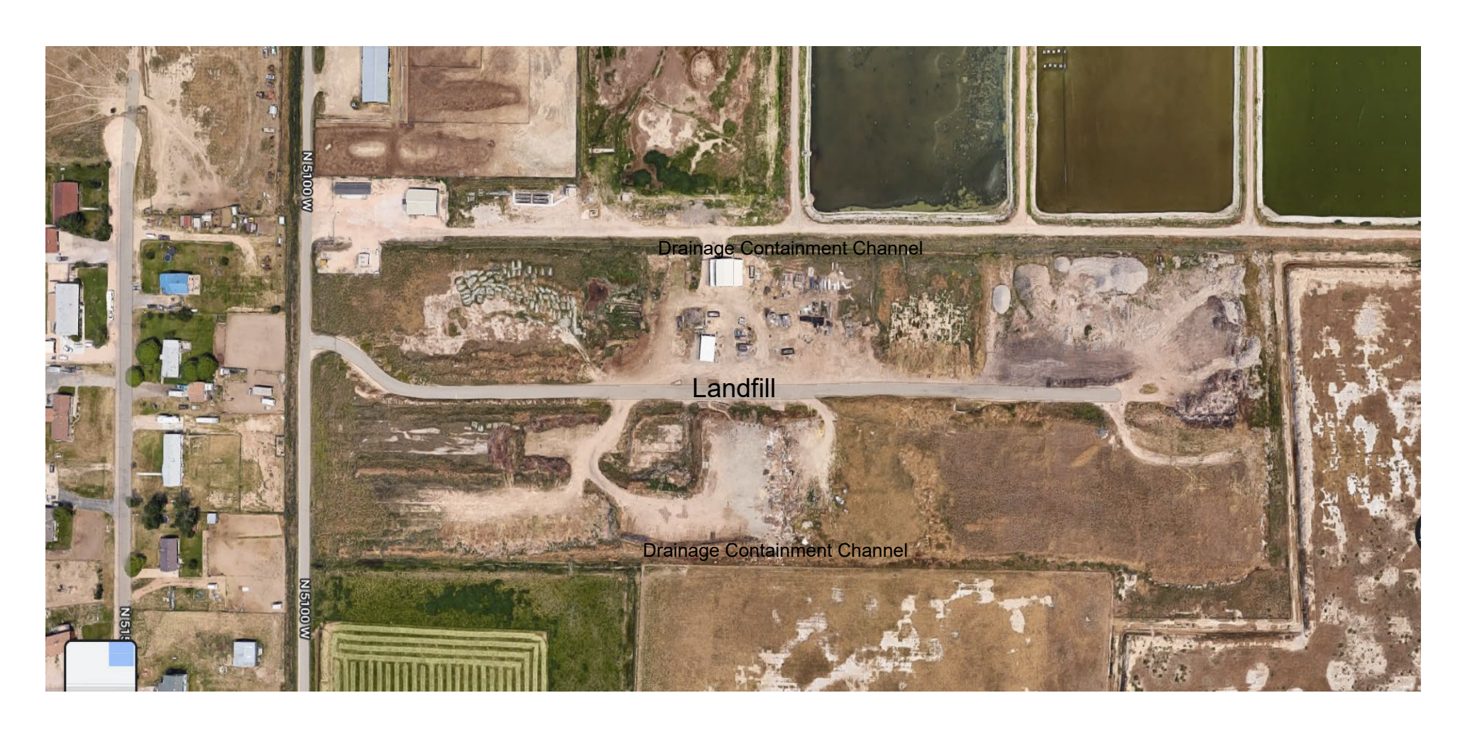
Plain City Landfill North bearing – top of map